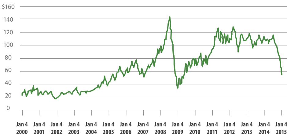
OIL: THE GLOBAL WILD CARD (BRENT CRUDE PRICE) — Oil Price