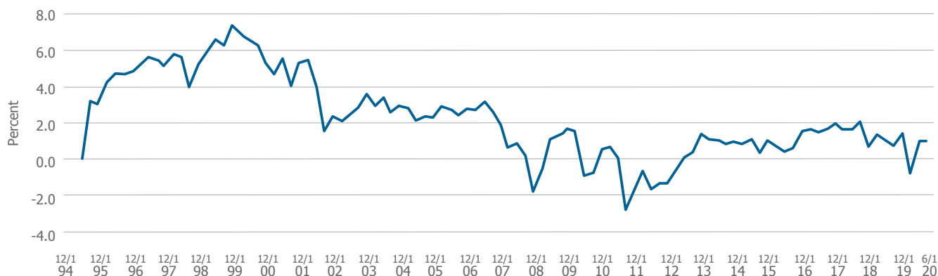
CHART 2 Implied Growth Rate – S&P 500

comparing them to historic averages. Using this methodology, we find that, at current prices, the implied perpetual growth rate for the broad market is actually quite muted, both on an absolute and historical perspective.