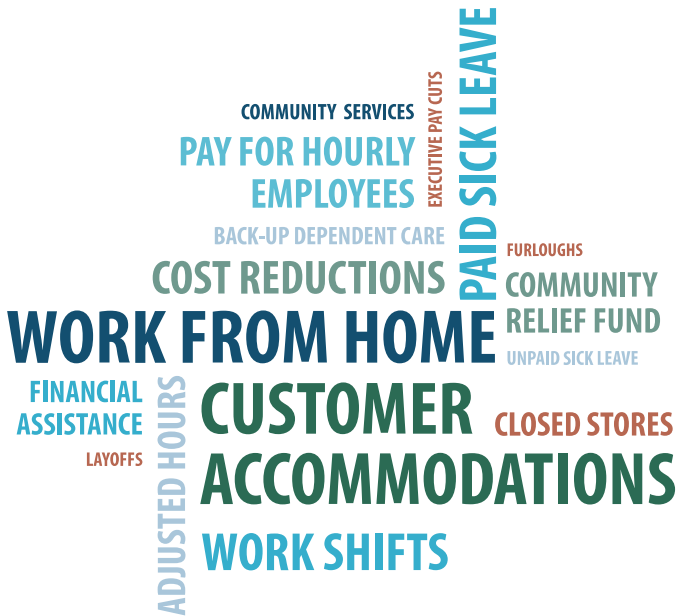
The 100 largest public employers in the U.S. are implementing a broad range of responses to the COVID-19 pandemic.

As investors, we have a unique opportunity to impact how our portfolio companies care for their workers, through the pandemic and beyond. As Catholics, we are also called to promote and protect the dignity of work. There are many ways you can support these vital efforts: